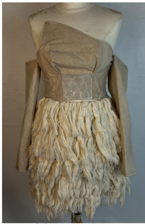
Ex BHS Student A-S Level Art Textiles Final piece